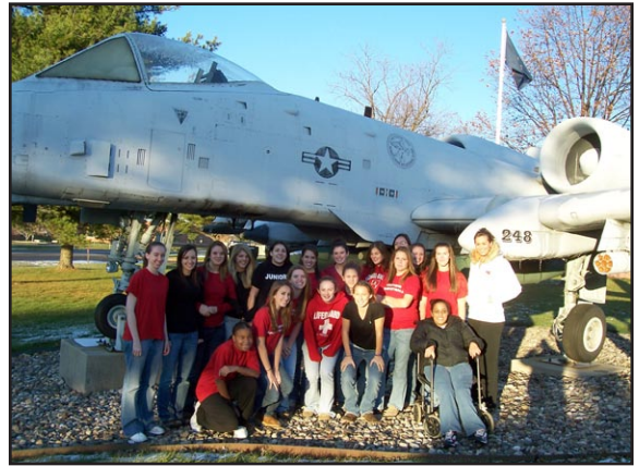
Hatboro Horsham High School girls basketball team visited the 111th FW Dec. 6.