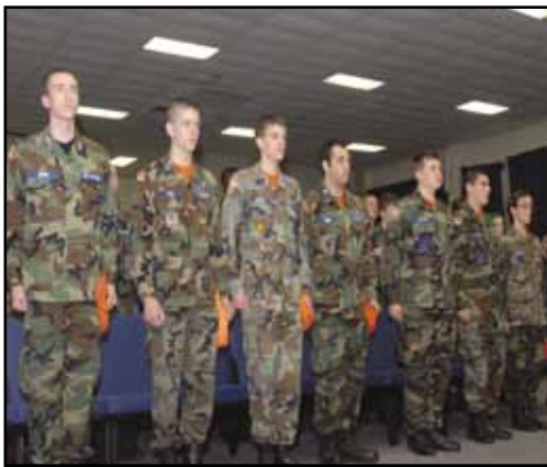
The cadets stand at attention during their graduation ceremony from their weekend training at the 111th Fighter Wing.

Best known for its members' work in search and rescue and disaster relief missions, CAP is expanding its role in the 21st century to include an increasing number of homeland security operations and exercises. CAP also performs counterdrug reconnaissance missions at the request of law enforcement agencies and can do radiological monitoring and damage assessment. CAP members undergo rigorous training to perform these missions safely and cost-effectively.