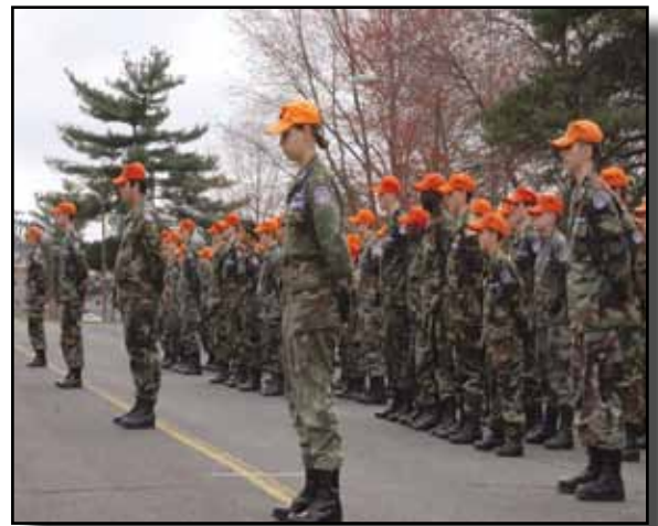
The cadets line up in their respective flights to report to their squadron commander.